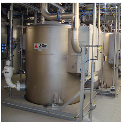
Vacuum conveying with integrated weighing