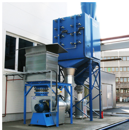
Central dedusting installation