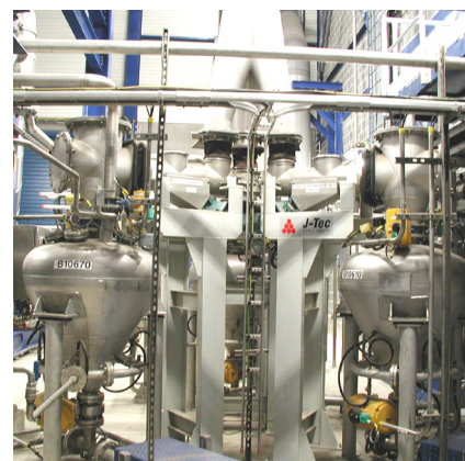
High pressure dense phase conveying