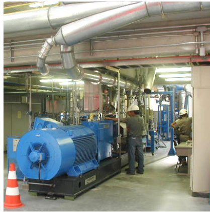
Extruder in the compounding industry