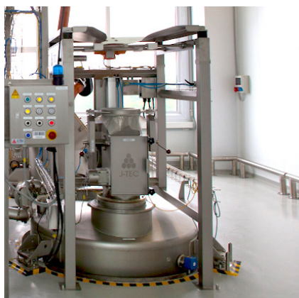
Big Bag® discharge station