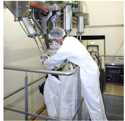
Big Bag® filling installation