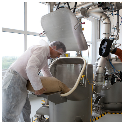
Bag dumping unit